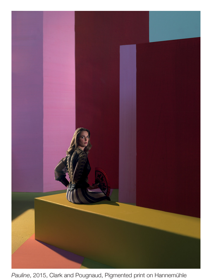
50 x 40 cm, Unique print © Clark et Pougnaud Courtesy Galerie Photo12

PREVIEW TUESDAY 20 OCTOBER - 6.30 - 9 PM